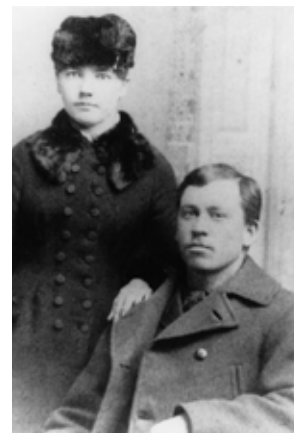
Young Laura & Almonzo

Rose, who is a writer herself, travels all over the world writing and living a life away from the farm. One day, far into the future, an elderly Laura is asked to speak at a book fair. While a nervous Laura approaches the stage, Almonzo hopes that Rose will come home to see her mother speak. As Laura speaks about her books, she sees her daughter in the crowd. Happily, Laura continues to reminisce about the life she has led, and Rose hopes that she can live up to her mother's example.