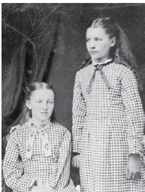
Mary & Laura

The year Charles and Caroline Ingalls are married, the country is in turmoil, nearing a civil war. A young Charles reads the headlines and hears the call of freedom ring throughout the nation. Though Caroline is wary about leaving her home, Charles convinces her that they can find a better life if they go west in search of land. The young couple packs their belongings and departs.